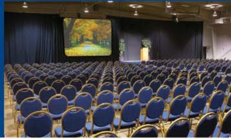
Exhibit Hall / Annex

The Exhibit Hall and attached Annex offer nearly 30,000 sq. ft. of versatile event space. The space is perfect for everything from trade shows, to banquets, to general sessions. Approximately 60% of the space in the Exhibit Hall offers carpeting, the rest of the area is epoxy flooring. The Annex