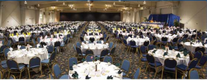
Exhibit Hall / Annex